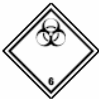
Figure 2. Danger sign for Infectious Substances