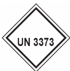
Figure 1. Hazard Label